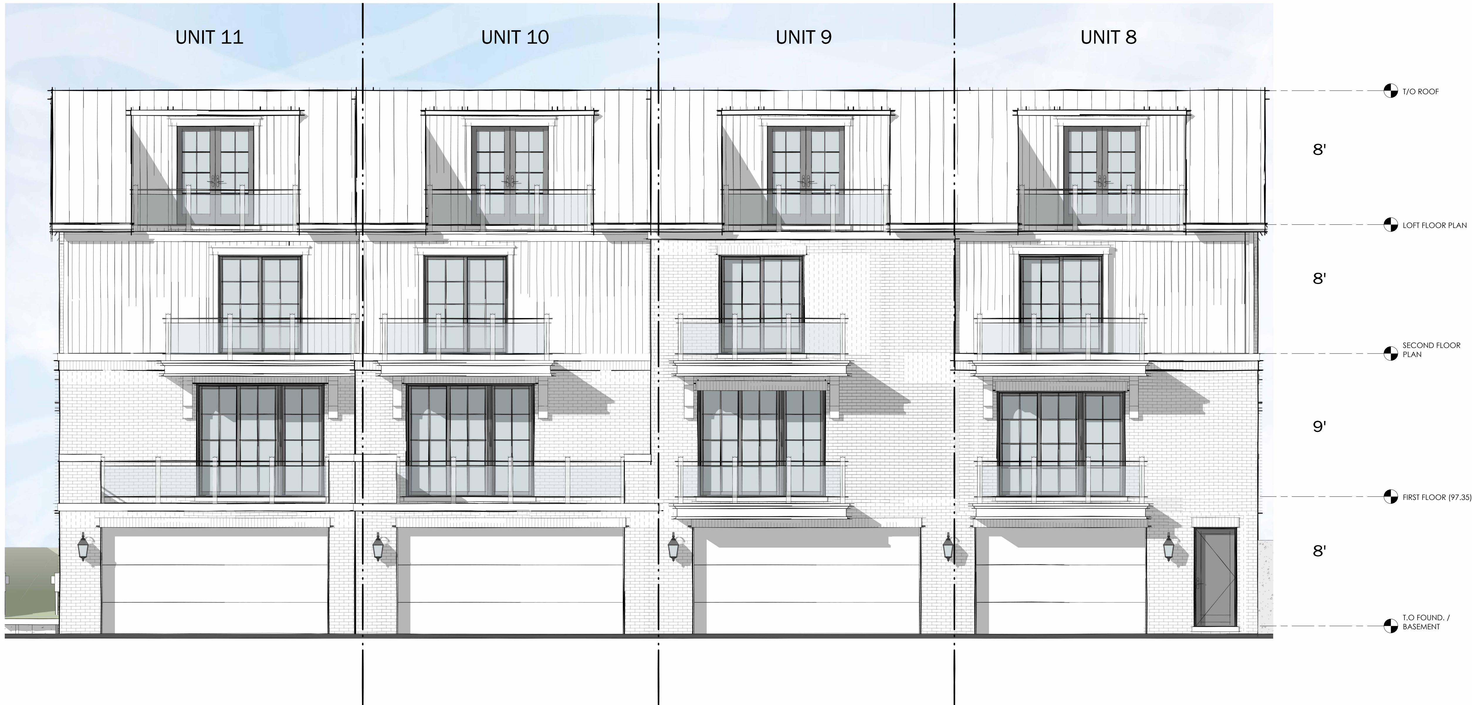
REAR ELEVATION - BLOCK 3 1/4" = 1'-0"

DISCLAIMER: : RENDERINGS/FLOORPLANS ARE ARTISTS CONCEPTIONS. ALL FLOOR PLANS ARE APPROXIMATE DIMENSIONS. ACTUAL USABLE FLOOR SPACE MAY VARY FROM THE STATED FLOOR AREA. ALL PLANS MAY BE SUBJECT TO MIRRORING. DESIGN TO BE CONFIRMED WITH ACTUAL ZONING BY-LAW FOR SUBJECT LOTS ONCE AN ACTUAL PARCEL AND MUNICIPALITY HAS BEEN CONFIRMED BY THE CLIENT