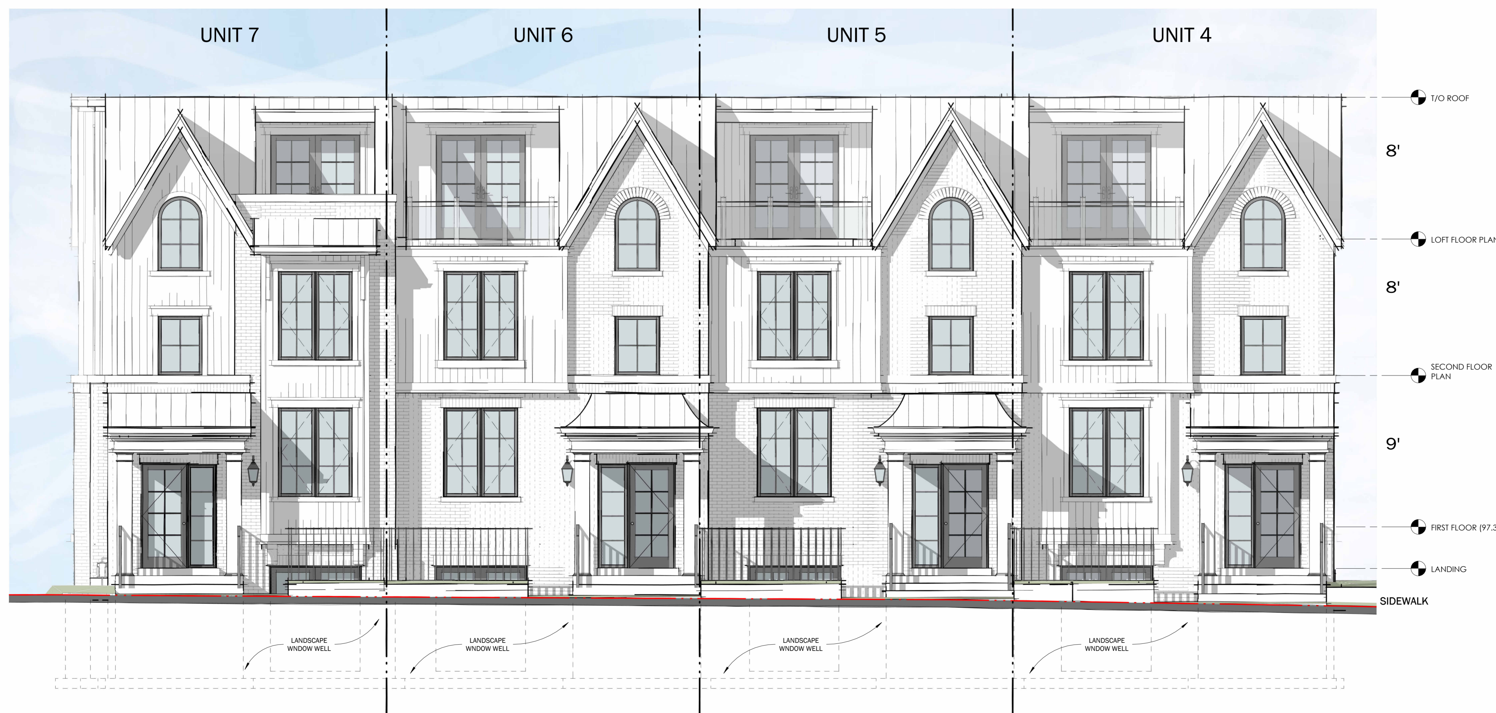
FRONT ELEVATION - BLOCK 2 1/4" = 1'-0"