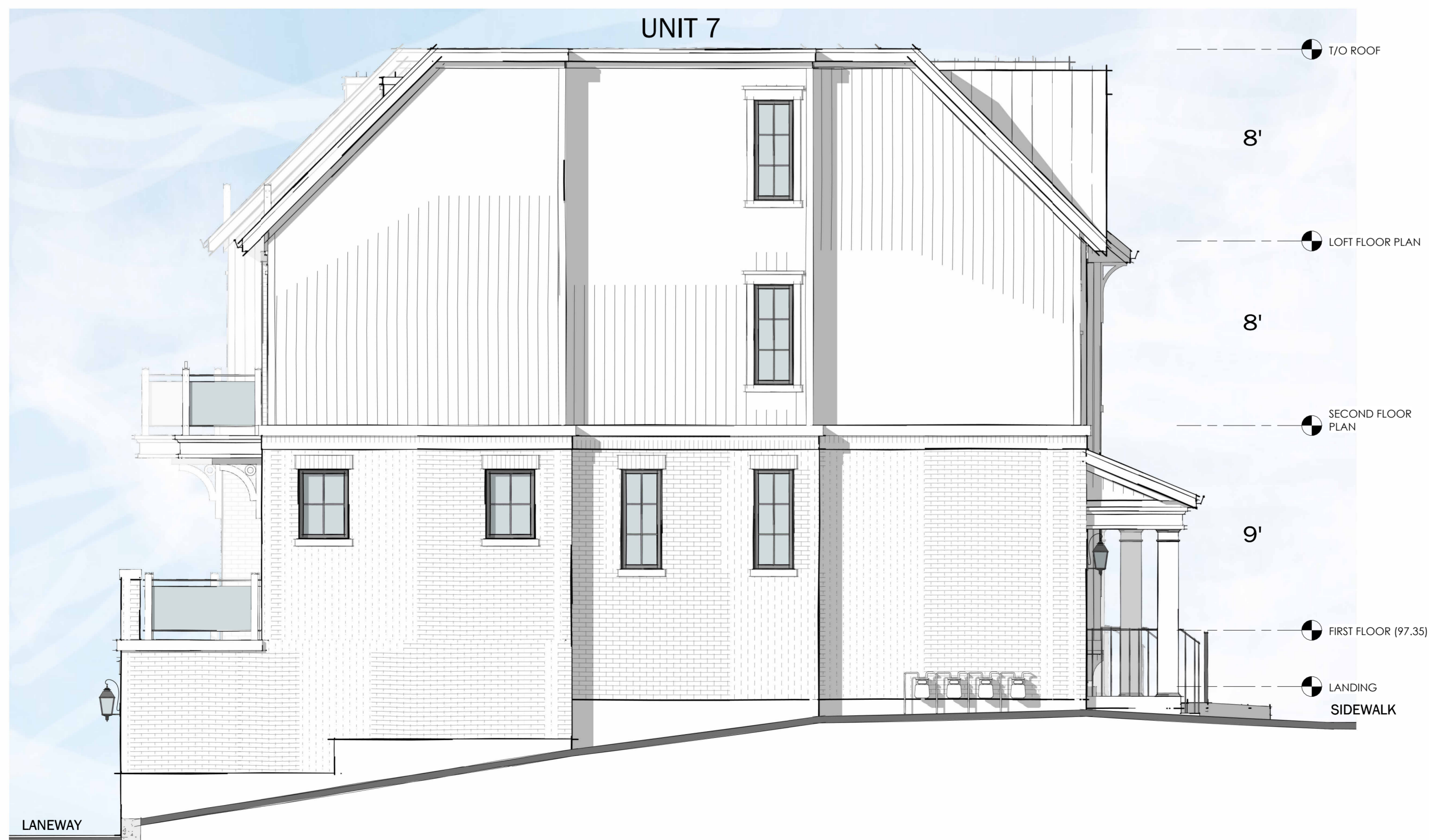
LEFT ELEVATION - BLOCK 2