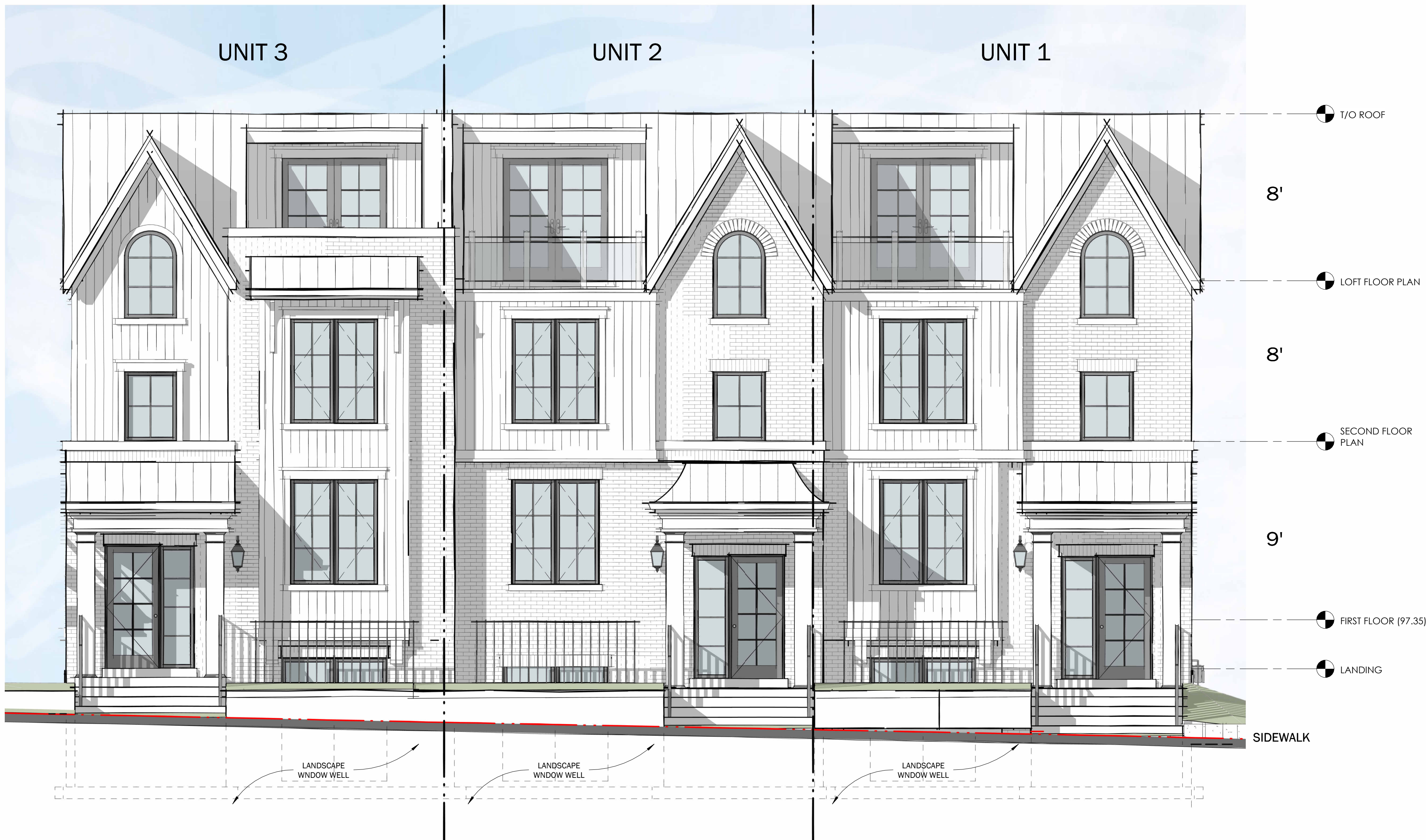
FRONT ELEVATION - BLOCK 1 1/4" = 1'-0"

DISCLAIMER: : RENDERINGS/FLOORPLANS ARE ARTISTS CONCEPTIONS. ALL FLOOR PLANS ARE APPROXIMATE DIMENSIONS. ACTUAL USABLE FLOOR SPACE MAY VARY FROM THE STATED FLOOR AREA. ALL PLANS MAY BE SUBJECT TO MIRRORING. DESIGN TO BE CONFIRMED WITH ACTUAL ZONING BY-LAW FOR SUBJECT LOTS ONCE AN ACTUAL PARCEL AND MUNICIPALITY HAS BEEN CONFIRMED BY THE CLIENT