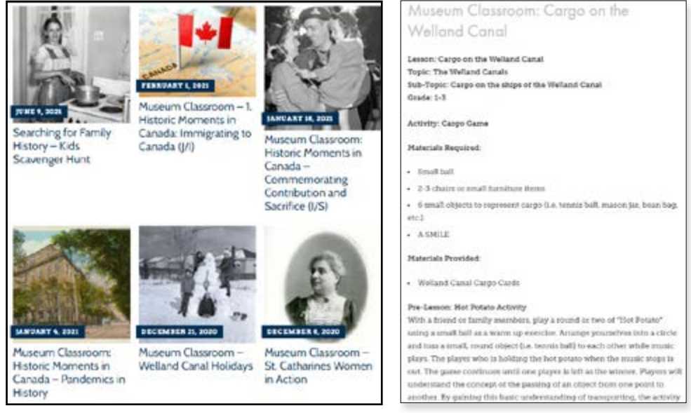
Museum Classroom on the blog.

Check out Museum Classroom on our blog <u>www.stcatharinesmuseumblog.com</u> for all sorts of fun activities doable from home or in the classroom. All your learners, no matter their schedule, access to technology, or location, will be able to participate with these lesson plans.