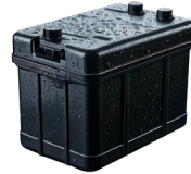
Secondary (backup) pumps, including battery-powered or water-siphon systems)