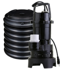
Sump pits and primary sump pumps