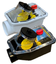
Mainline backwater valves

FLAP provides reimbursement for the following flood protection devices and associated installation work: