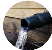
Related discharge piping